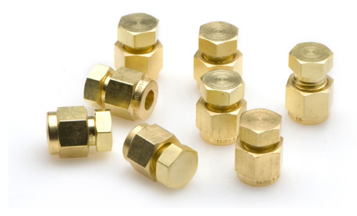
Figure 1: Two-piece brass storage caps.

Sorbent tubes are most effectively sealed with two-piece, brass, ¼" screw-caps with single PTFE ferrules (Figure 1). These types of seal have been demonstrated to ensure minimum ingress of external artefacts and minimal loss of sampled components over storage periods up to 27 months.<sup>1-3</sup> They are also recommended by international