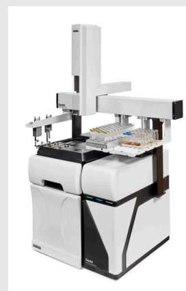
Figure 1: HiSorb workflow on the Centri platform.

For more on Centri, visit www.markes.com .